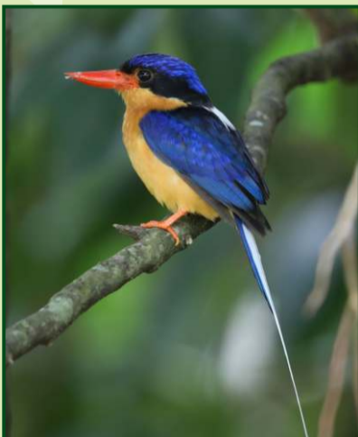
Buff-breasted Paradise-Kingfisher