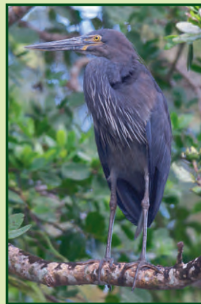
Great-billed Heron - Jun Matsui

Other interesting animals occurring in North Queensland include Platypus, Echidna, Tree Kangaroo,, a variety of possums, the iridescent Cairns Birdwing and Ulysses butterflies, Giant White-lipped Tree Frog and Boyd's Forest Dragon.