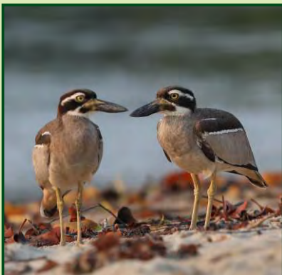
Beach Stone-curlew - Doug Herrington