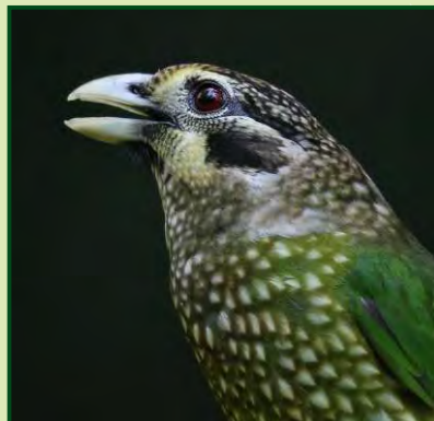
Spotted Catbird