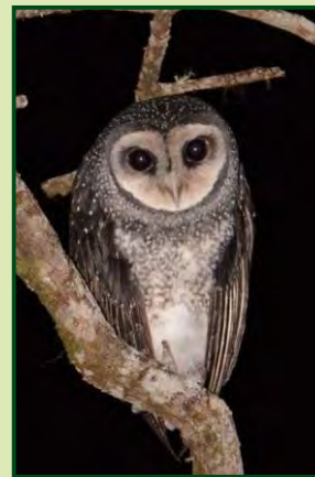
Lesser Sooty Owl - Patrick De Geest