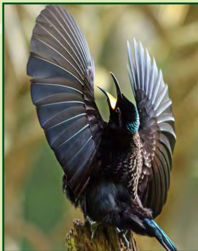
Victoria's Riflebird - Atherton Birdwatchers Cabin