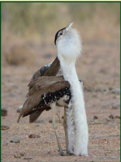
Australian Bustard - Patrick De Geest