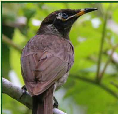
Bridled Honeyeater