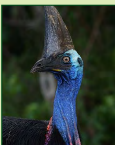
Cassowary